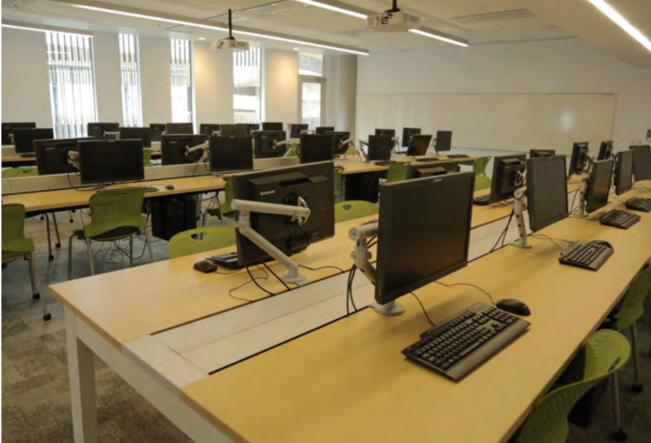
Spatial Analysis Laboratory (SAL) in the ENR2 Building